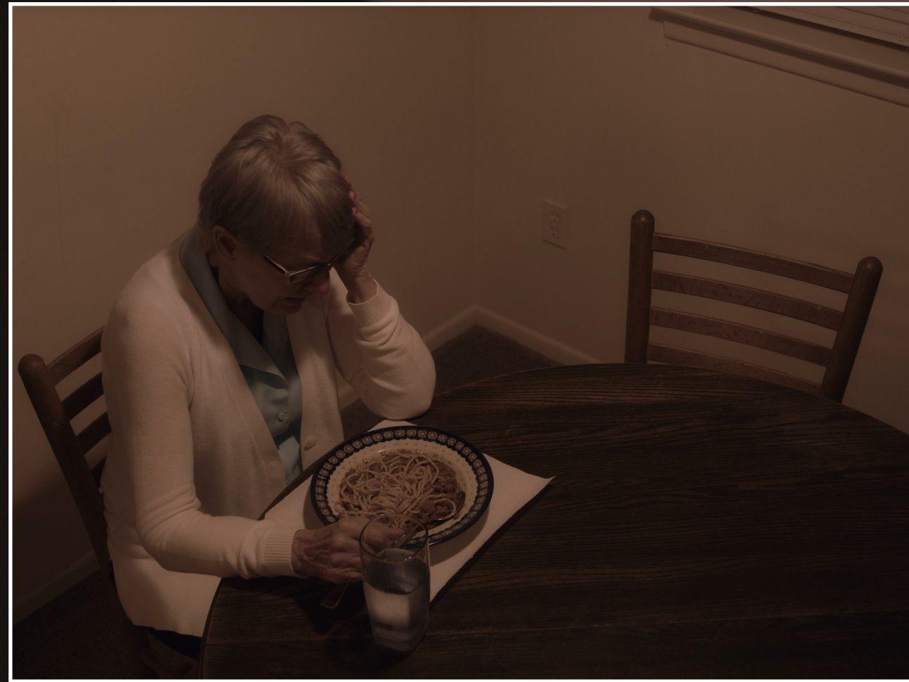
DINING ROOM - NIGHT